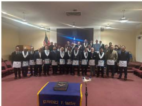
[Stated Meeting, January 3, 2026]