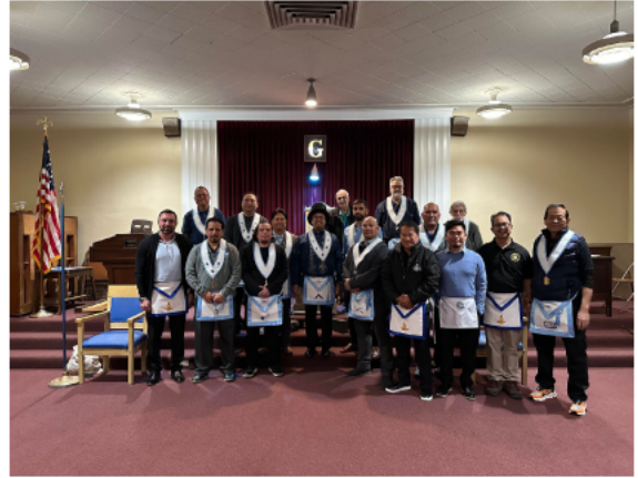
[Stated Meeting, January 6, 2024]

Source: Rosten, Leo. Leo Rosten's Carnival of Wit . New York: A Dutton Book, 1994. Print. pp. 287-290.