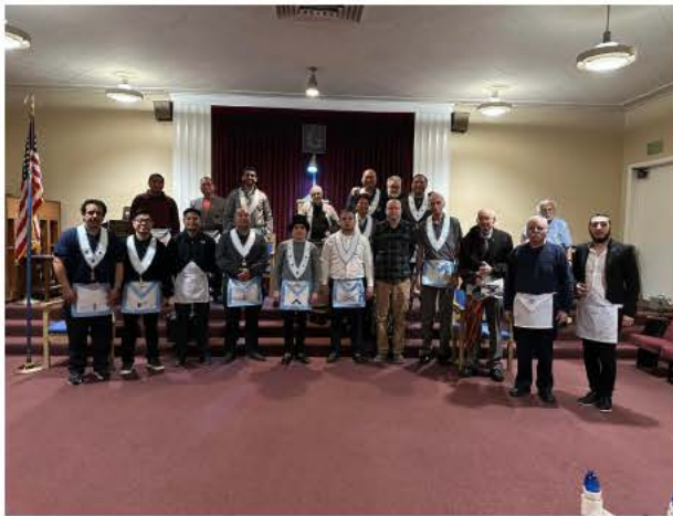
[Stated Meeting, March 2, 2024]