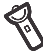
[Pictured above: Masonic Light]