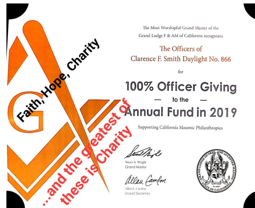
Above: Certificate from Grand Lodge

Here are some images you may enjoy seeing.